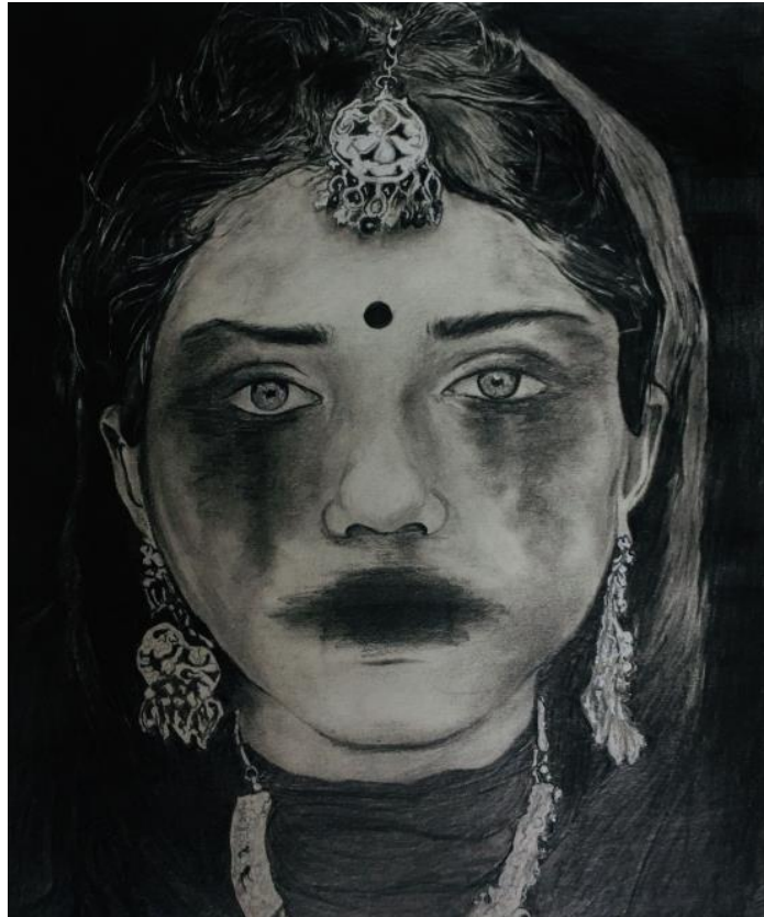
Third prize winning poster