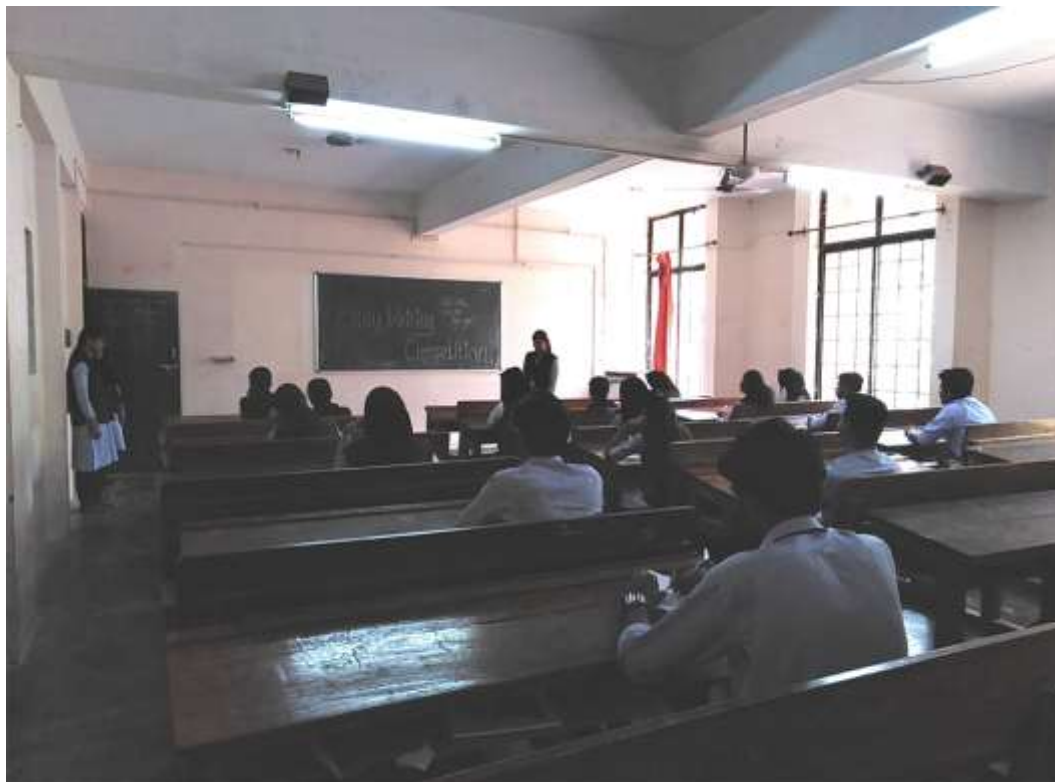
{ESSAY WRITING COMPETITION}