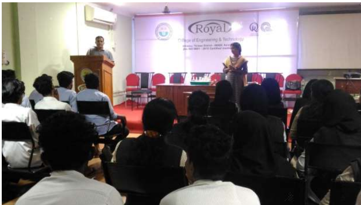
NSS Unit of RCET organised *Food Safety Awareness* program in the main seminar Hall on 9/5/19.